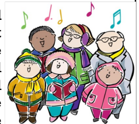
"Join us for Caroling!"

Christmas Caroling is planned for Tuesday, Dec 17. Meet at the church at 10 AM and we will go out to home bound and group homes to spread some Christmas cheer. We have books and all voices are welcome and needed! We will break for lunch and finish about 2PM. Join us for any part of the day that works for you. It is the best thing we can do to celebrate the season!